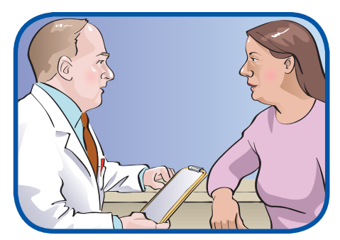
Call your HCP if you do not feel better or if your blood sugar stays low (below 70 mg/dL)